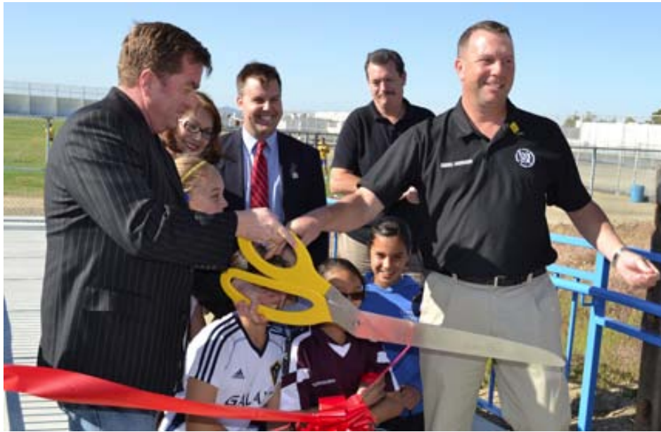
Community Bridge Inaugurated at Bonita Vista Middle